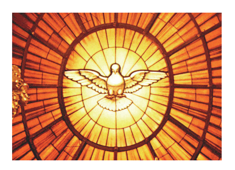
"Lord, send forth your Spirit, and renew the face of the earth"

As summer approaches life tends to become a little more relaxed. Longer days mean bedtimes become less specific, warmer days mean ur food and drink consumption changes and, hopefully, we take full advantage of these lovely days by spending more time with our children. This summer, be specific and plan what you would like to accomplish with your children: more reading together, more time hiking more family game nights, more time spent preparing and cooking as a family, etc. Time spent together creates confident, healthy children; when we include daily prayer with our family, life is golden!